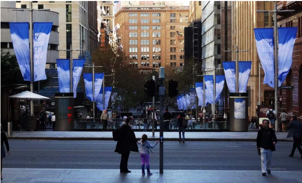
Attachment A: Martin Place Smoke-Free Trial – Promotional Materials